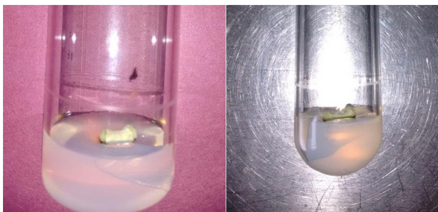
Callus in GA_3 5mg/l