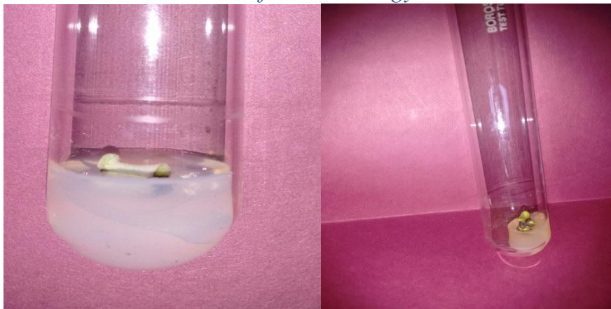
Callus initiation in GA_3 4 mg/l